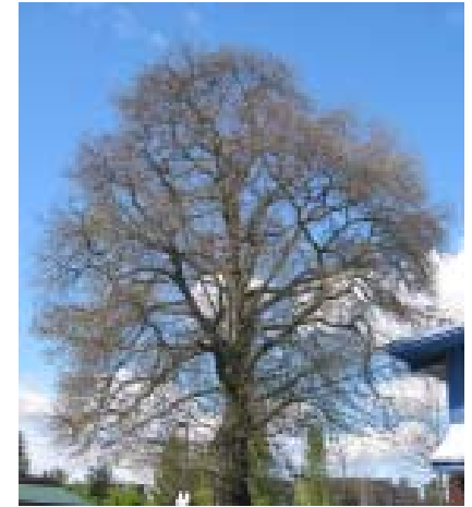
A Spanish Chestnut Tree ( Castanea sativa ) located on NE 175th Street is one of two City Heritage Trees.

A city-approved recognition plaque will be placed at any officially designated heritage tree(s). The tree(s), nominee and property owner will receive special recognition from the City Council.