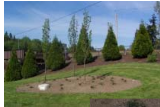
The first Tree Tribute Grove was planted at Wilmot Gateway Park in 2004.

By definition, the grove must consist of at least three (3) trees planted in a natural setting in one of the City's parks or streetscapes.